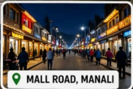
MALL ROAD, MANALI